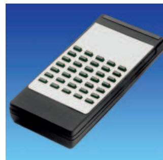
radio-transmitter type FU-S/S with 35 keys/channels. Number of keys an designation acc. to specification. Order-no.: 52.00.000