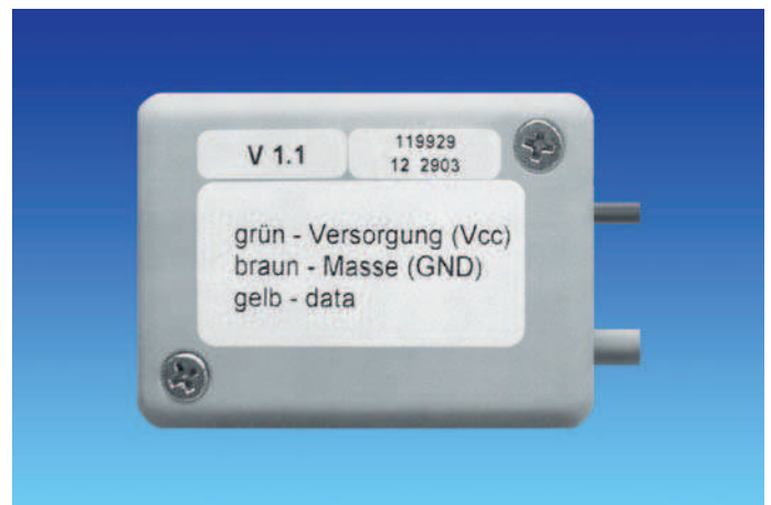
Radio receiver type FU-E/S, order-no.: 52.10.000