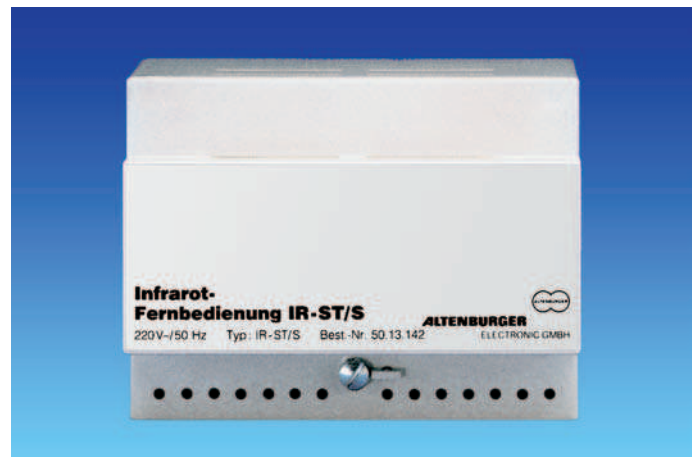
IR-and radio control module type IR-ST/S, order-no. 50.13.142

The distance between radio-transmitter and radio receiver can be max. 40 m. Up to 6 receivers can be connected for the extension of the recognized distance.